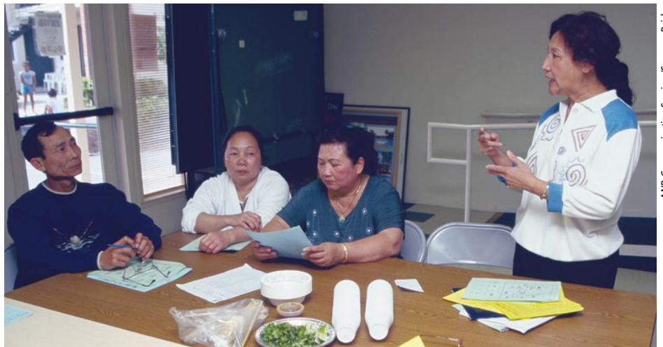
EFNEP provides 4 to 6 weeks of classes in a small-group setting to more than 13,000 low-income California families each year. The program is administered by UC nutrition scientists and educators.

The EFNEP program (in both Virginia and in California) teaches low-income families how to purchase, safely prepare and serve a balanced, highly nutritious diet. The program emphasizes the increased consumption of fruits and vegetables, decreased consumption of fat, and improved skills in food safety, preparation and shopping, with the long-range goal of improved health and risk reduction for chronic diseases. The 1990 Dietary Guidelines for Americans were the basis for instruction during the time of this study (USDA/DHHS 1995), although the recently updated version is currently used. Participants receive intensive nutrition education from